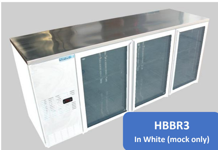
HBBR3 In White (mock only)