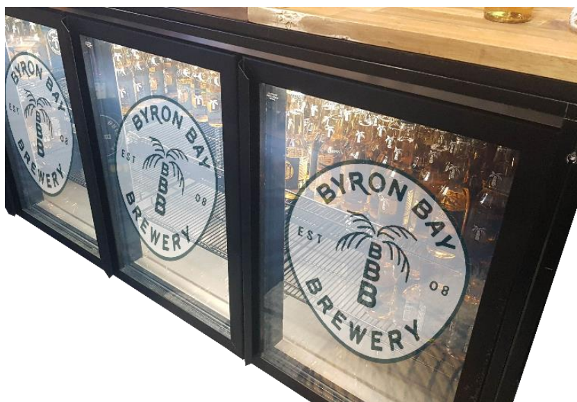
HBBR3-B Optional Custom Decals (additional cost)