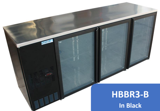
HBBR3-B In Black