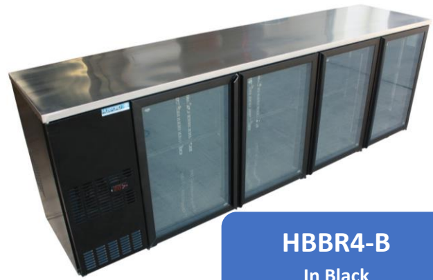
HBBR4-B In Black