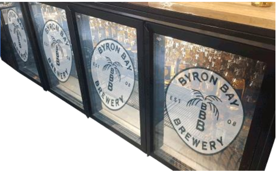
HBBR4-B Optional Custom Decals (additional cost)