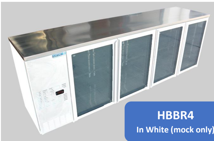
HBBR4 In White (mock only)