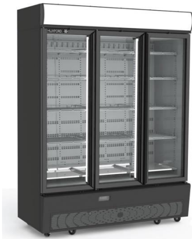
BMH45-B In Black