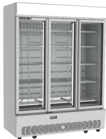
BMH45 In White