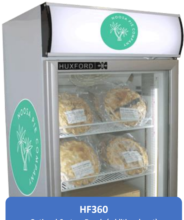
Optional Custom Decals (additional cost)