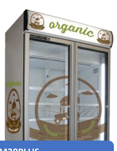
HFM30PLUS-B In Black