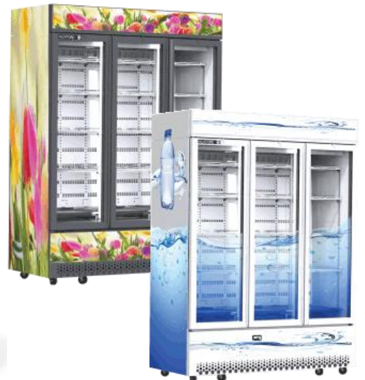
HPM1350-B & HPM1350 Optional Custom Decals (additional cost)