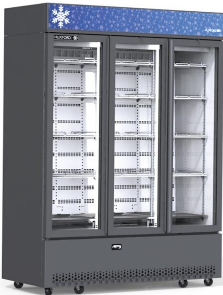
HPM1350-B In Black