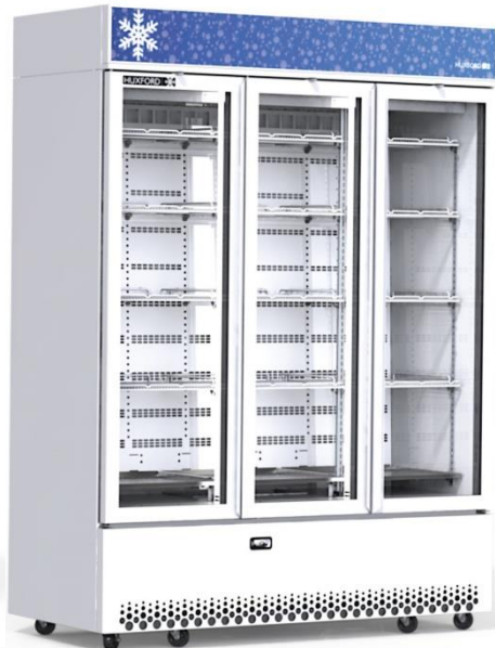
HPM1350 In White