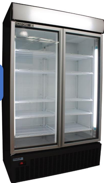
HSM40-B In Black