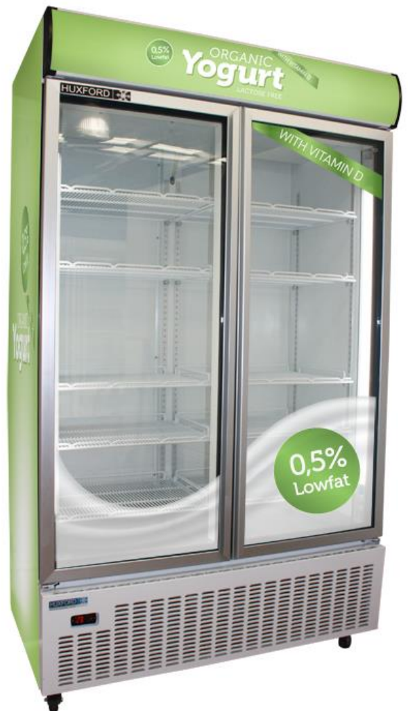
HSM40 Optional Custom Decals (additional cost)