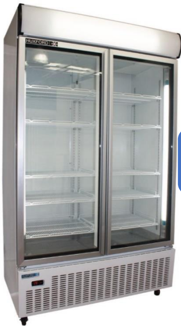
HSM40 In White