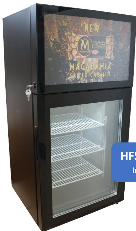
HFSD50-B In Black