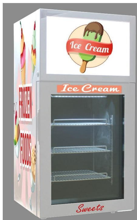
HFSD50 Optional Custom Decals (additional cost)