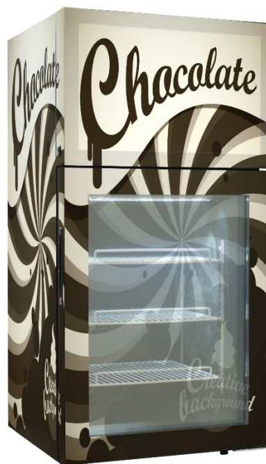
HFSD50-B Optional Custom Decals (additional cost)