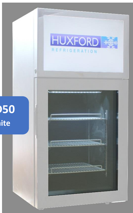
HFSD50 In White