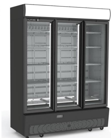
BMH45PT-B In Black