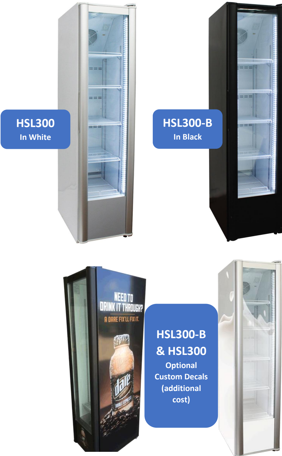
HSL300 In White